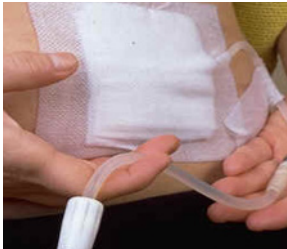
Example of a catheter dressing.

The catheter dressing should be changed three times a week. You can do this yourself or have it done by your partner or home nurse. You will be taught how to perform the dressing care correctly and what signs to look for to detect infection early.